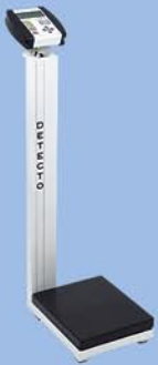
6027 Waist-High Scale