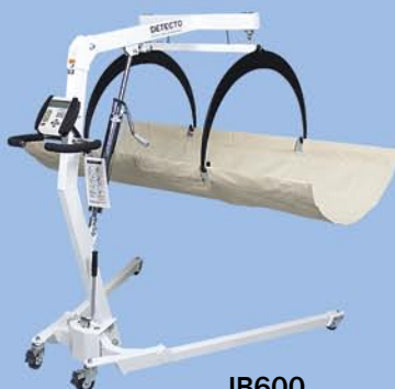
IB600 In-Bed Scale