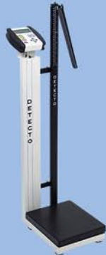
6029 Waist-High Scale With Height Rod