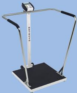
6856 Bariatric Scale