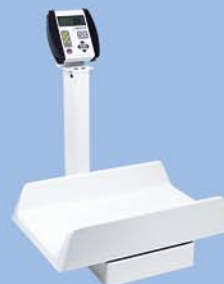
8435 Pediatric Scale