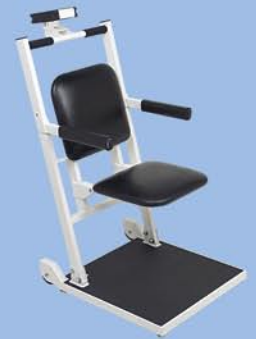
6876 Bariatric Stand-On/Chair Scale