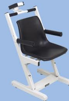
6875 Euro Chair Scale