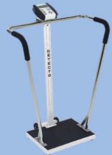
6855 Bariatric Scale