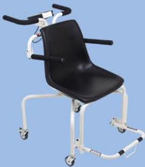
6880 Rolling Chair Scale