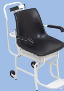
6475 Chair Scale