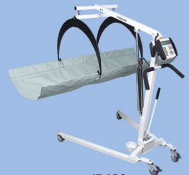
IB400 In-Bed Scale