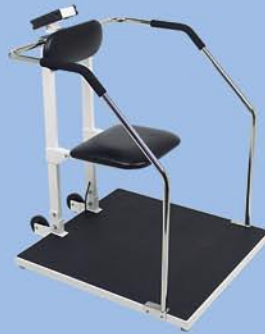
6868 Bariatric Flip Seat Scale