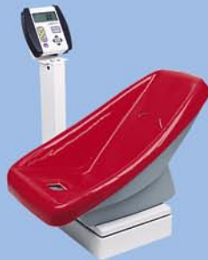
8432CH Pediatric Scale