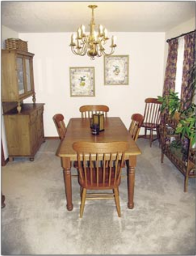
Elegant chandeliers and two large windows accentuate the spacious formal dining room located conveniently next to the main entrance.