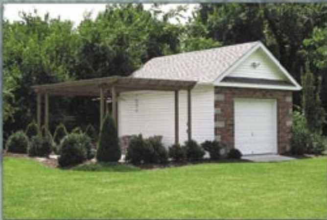
Another unique feature is the matching utility building with garage bay and workbench plus adjoining pergola for additional outdoor seating.