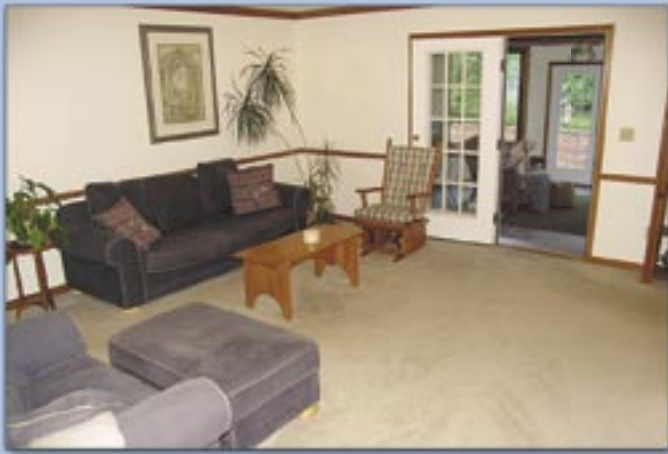
The large 16.5 ft. x 16.5 ft. centrally-located living room features a tray ceiling, crown moulding and convenient access to the sunroom.