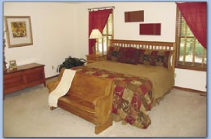
The spacious master bedroom features wood blinds, tray ceiling, crown moulding, and two extra-large his and hers walk-in closets.