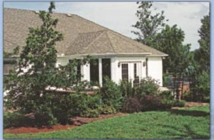
The sunroom creates an intermediary stage between the home and the outdoors. Its large casement windows provide a stunning view.