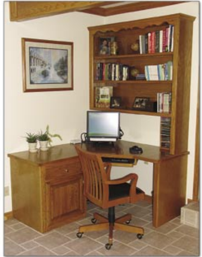
The sunroom features two matching built-in oak desks and bookshelves. The house is wired for broadband Internet access and cable TV.