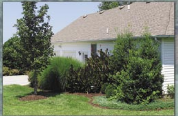
The 2.18 finely-manicured acres have been exquisitely landscaped with low-maintenance planting beds featured on the Carthage Garden Tour.