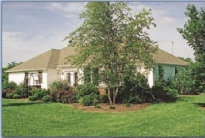
The durable brick and concrete patio provides ample room for dining and entertaining. The lush surrounding foliage creates serenity and privacy.